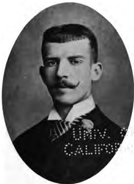
Julián del Casal